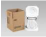
Gallon Page 3