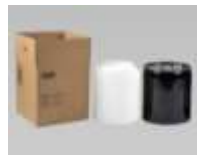
5 Gallon Page 13