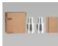
Catalyst Kit Page 14