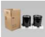
5-Gallon Page 4