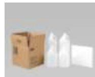
Gallon Round Plastic Page 11