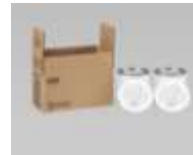
Quart Page 15