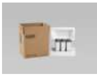
F-Style Quart/Pint Page 8