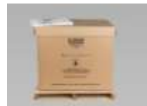
Intermediate Bulk Containers (IBC) Page 18