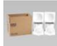
2,4,6 Quart Page 6