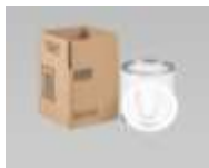
Gallon Page 12