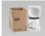
1/1 Quart Page 5