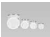
Normlock Page 17