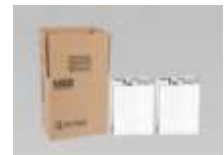
F-style Gallon Page 16