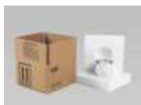
Pint Page 10