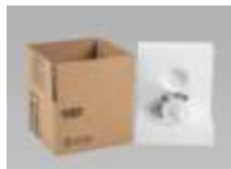
Half-Pint Page 9