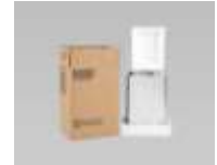
F-Style Gallon Page 7