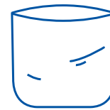
POUCHES WITH LIP